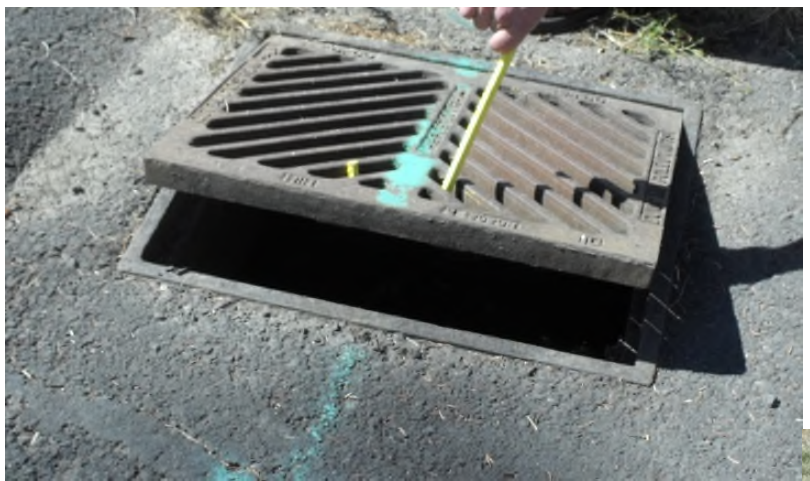
Step 6 - Use the grate lifting hook to remove the catch basin grate. Catch basin grates are heavy, so use suitable footwear and proper lifting techniques. Get help if needed. Use caution to keep people and objects from falling into the open catch basin.